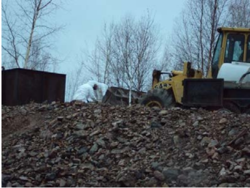
SRC's Asbestos Expert