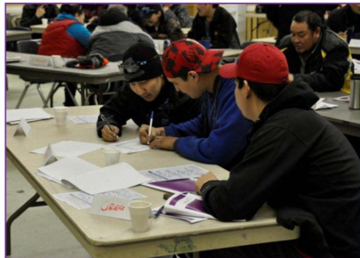
Small Group Work