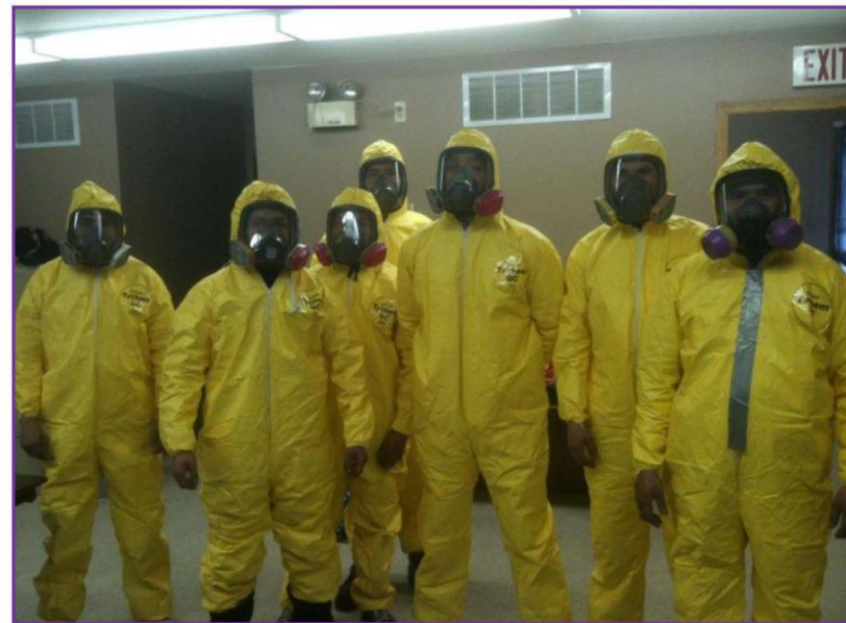
Part of the Wollaston Class