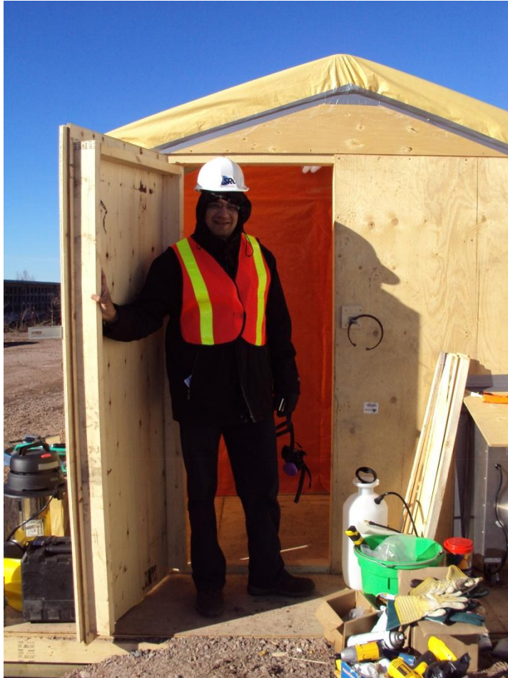
Safety Surveillance by SRC