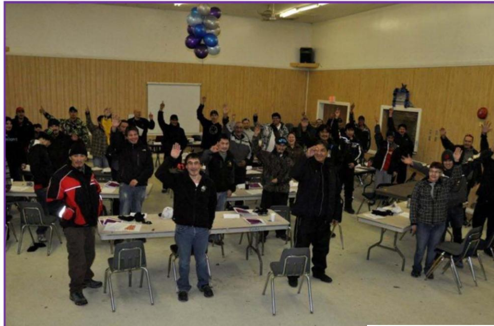
Practicing Hand Signals