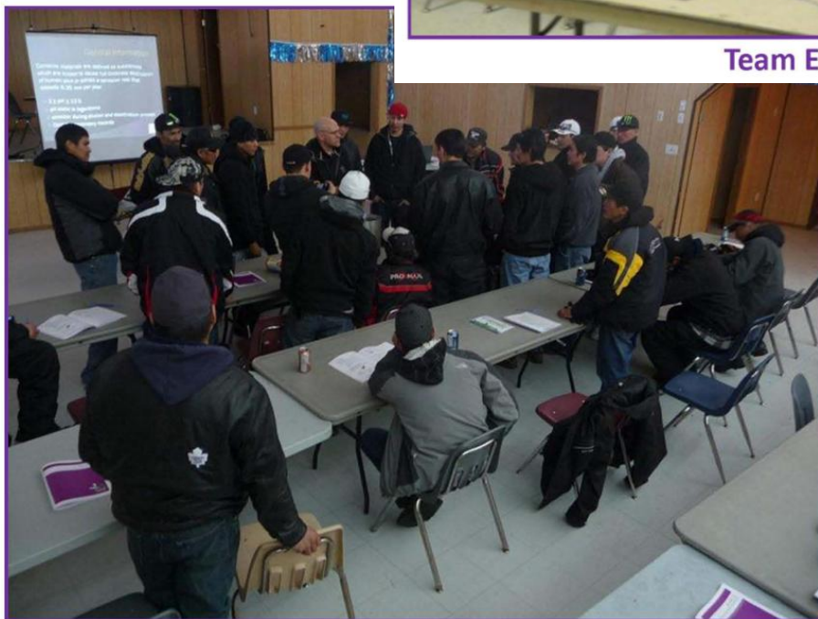
Corrosive Liquids Discussion