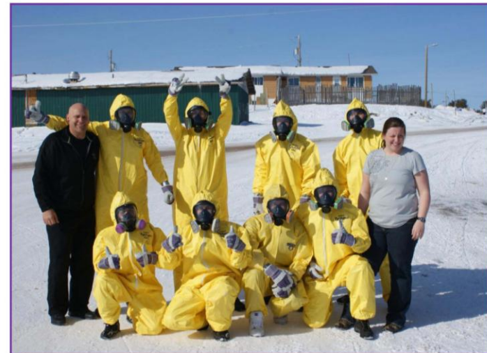
Posing in Tyvek in Black Lake