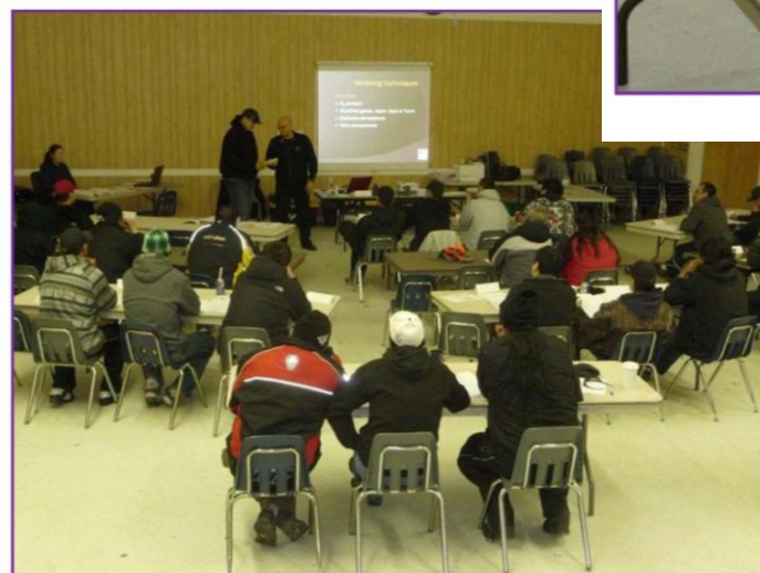
Meters and Monitors