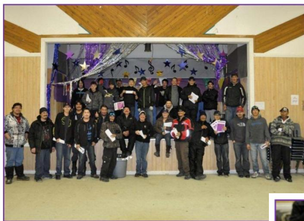
Wrapping up training with the Fond du Lac class