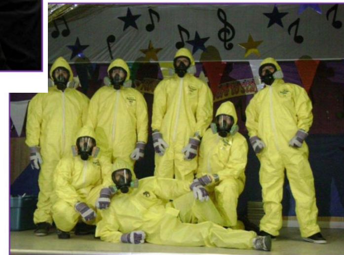
Posing in Tyvex in Fond du Lac