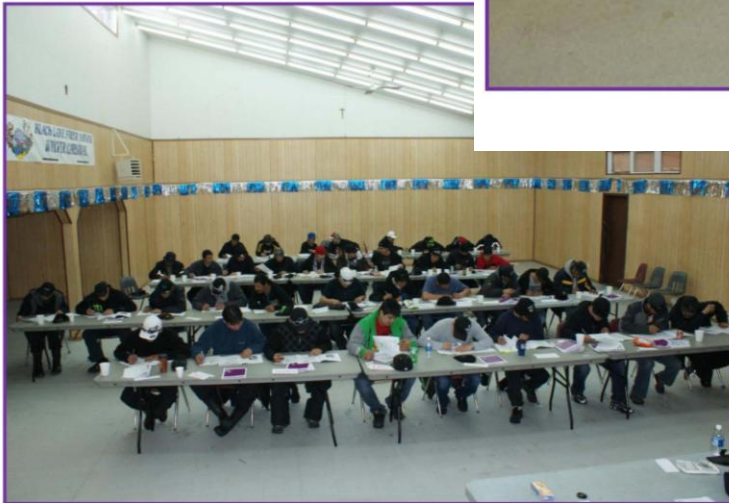
Writing a Quiz