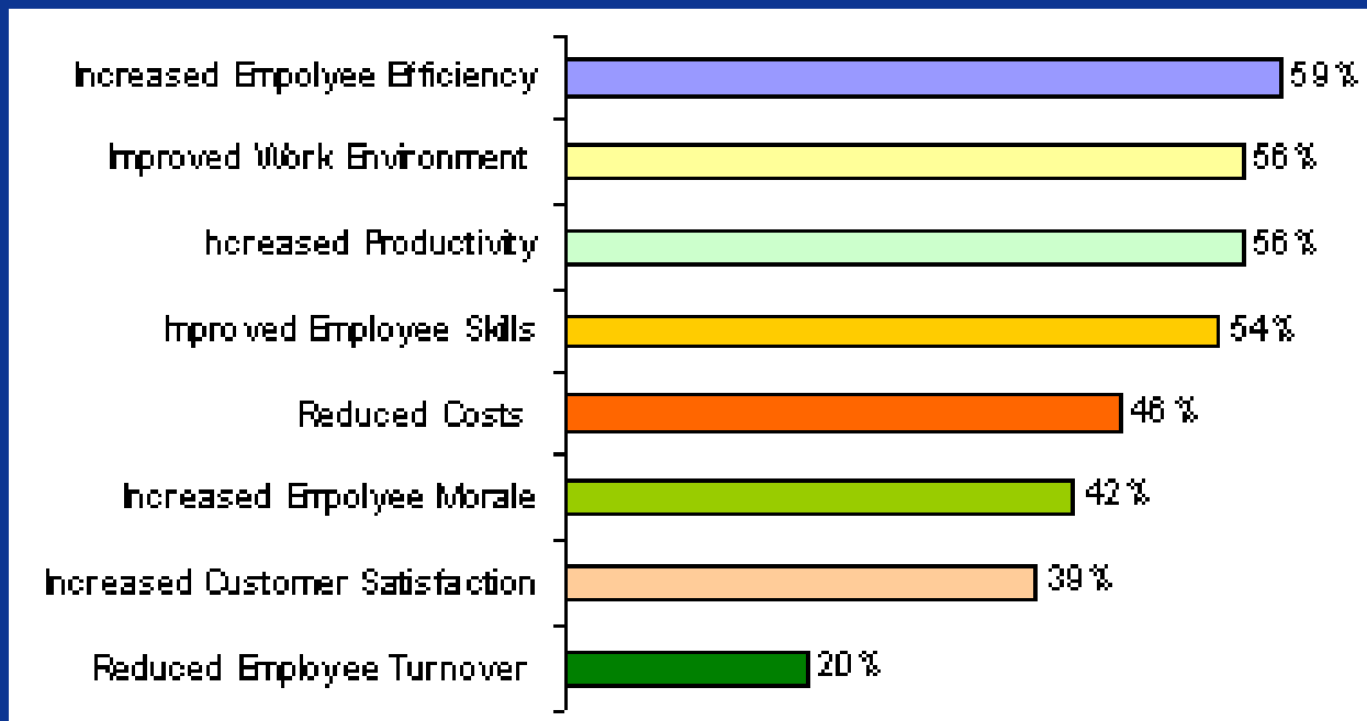
Impact of LEAP Services (% of Surveyed Clients)